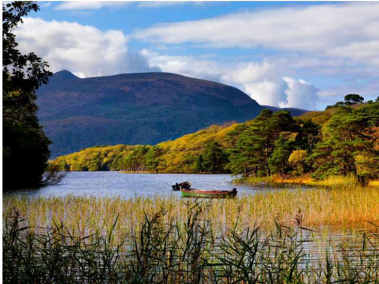
Killarney National Park